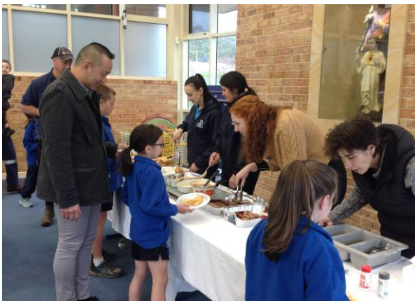
Father's Day Breakfast