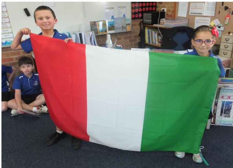
Italian at St Joseph's