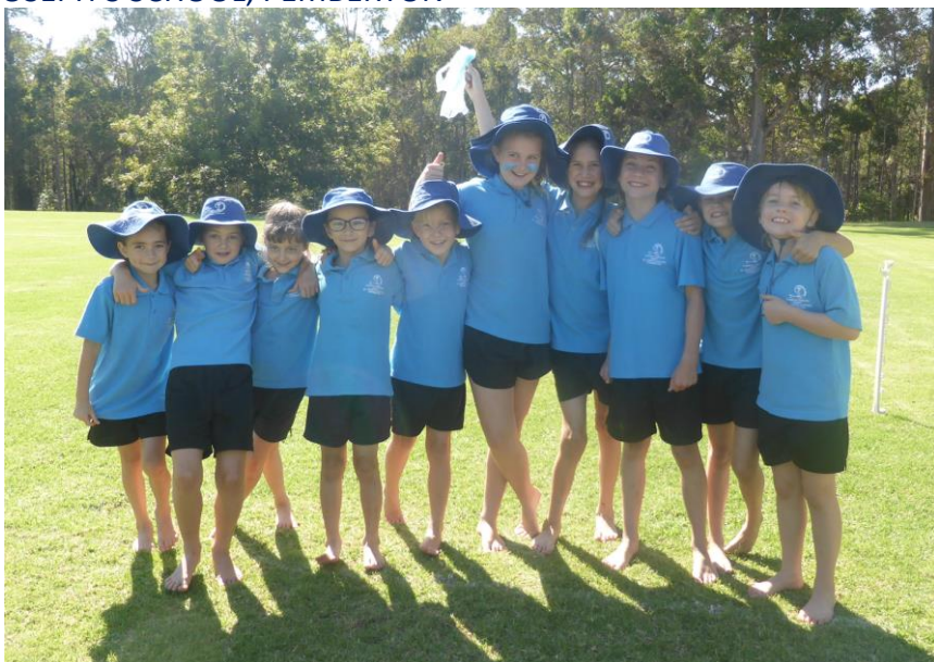
Great team spirit at the Athletics Carnival!