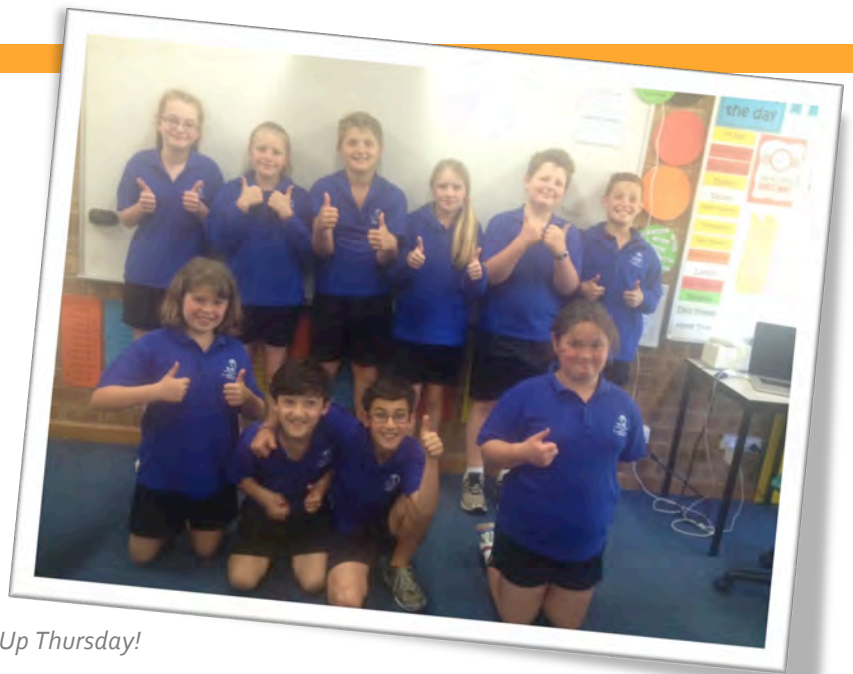
It's Thumbs Up Thursday!